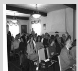
Pre-Commencement Ceremony 2002

On December 12 th , 2002, the Honors College, along with members of the Honors College Board and Honors Advisory Board, family and friends, recognized our students graduating "With Honors."